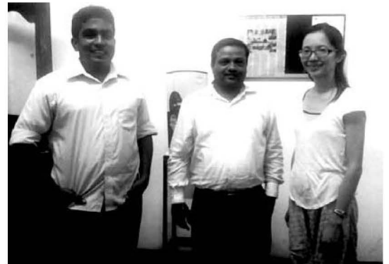
Asia Art Archive website : www.aaa.org.hk